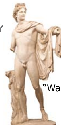
"Walking With The Gods"

March 6 - March 13 April 3 - April 10 May 1 - May 8 June 12 - June 19 July 3 - July 10 August 7 - August 14 September 4 - September 11 October 2 - October 9 November 6 - November 13 December 21 - December 28 Christmas Special December 29 - January 5 New Year Special (2016-2017)